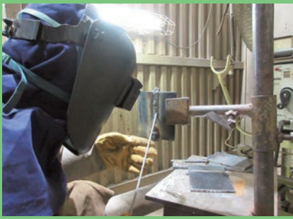
Shielded Metal Arc welding