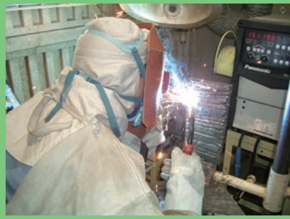
CO 2 -MAG welding