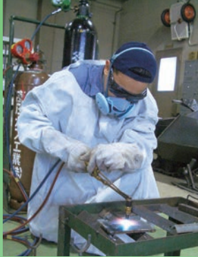
Gas cut & welding