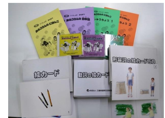
▲ 『Mieko san no Nihongo』 Series

With the aim of helping educators teach Japanese to non-Japanese students, we have created an original textbook series called 『 Mieko san no Nihongo 』 and we are distributing it for free to public schools around Mie. We also operate a multi-cultural education center called 「Mi-ku」 that contains teaching resources and books on Japanese language teaching.