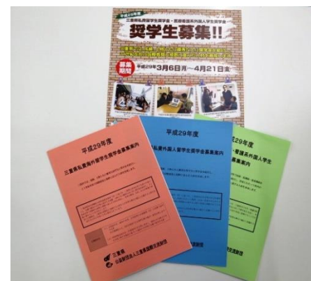
【Foreign Students Scholarship】▶

In response to the commission from Mie Prefecture, MIEF offers scholarships to local residents who are interested in studying overseas. We also act on behalf of the Mie Prefectural Government to invite Japanese teachers from overseas to come to Japan to increase their knowledge and further improve their skills.